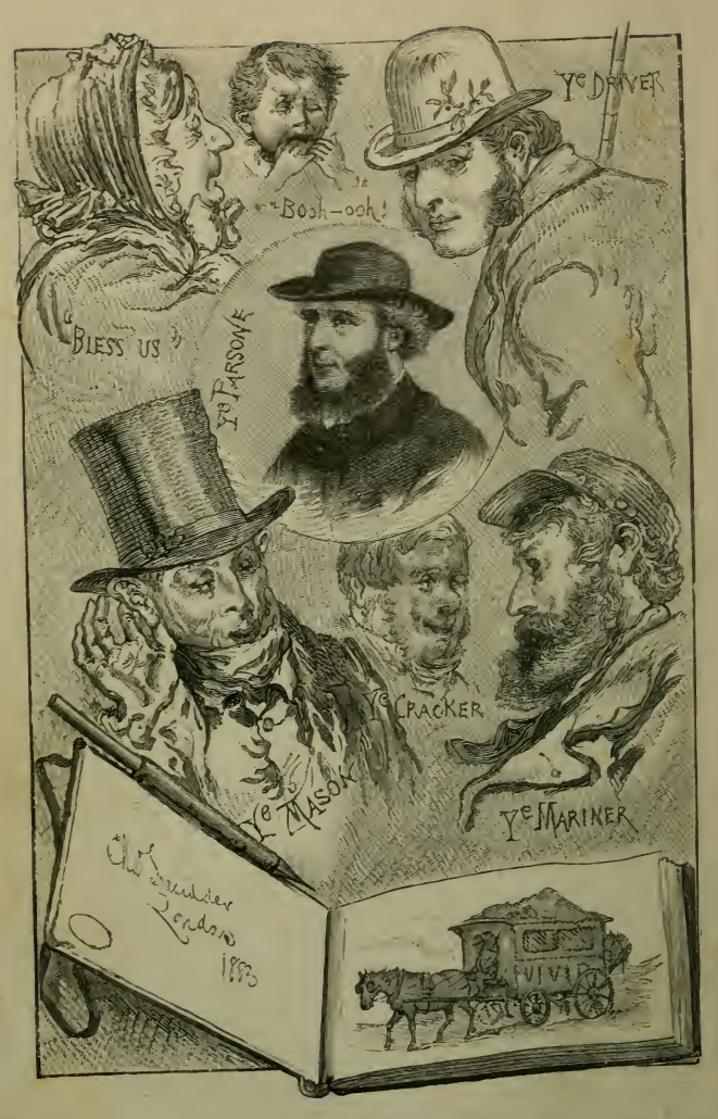
CHRISTMAS EVE IN THE 'VIVID.' | See page 133,